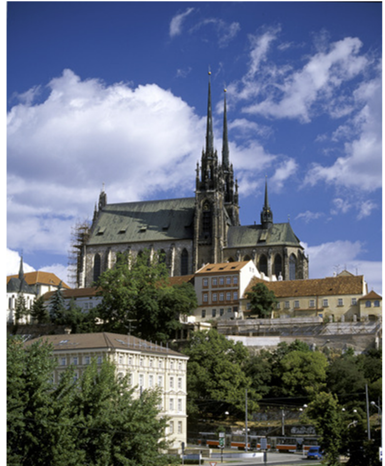
Cathedral of Saints Peter and Paul