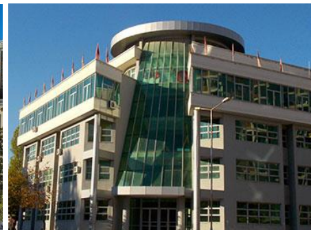
Faculty of Natural and Technical Science