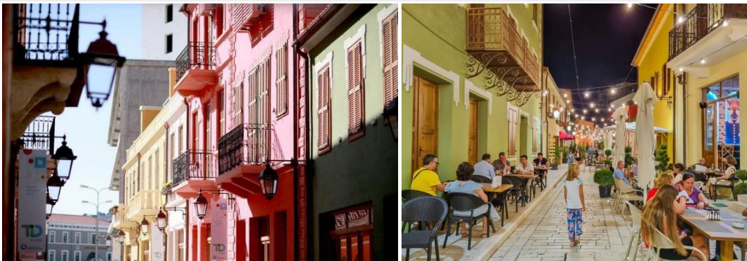
Walking tour to Vlorë old town