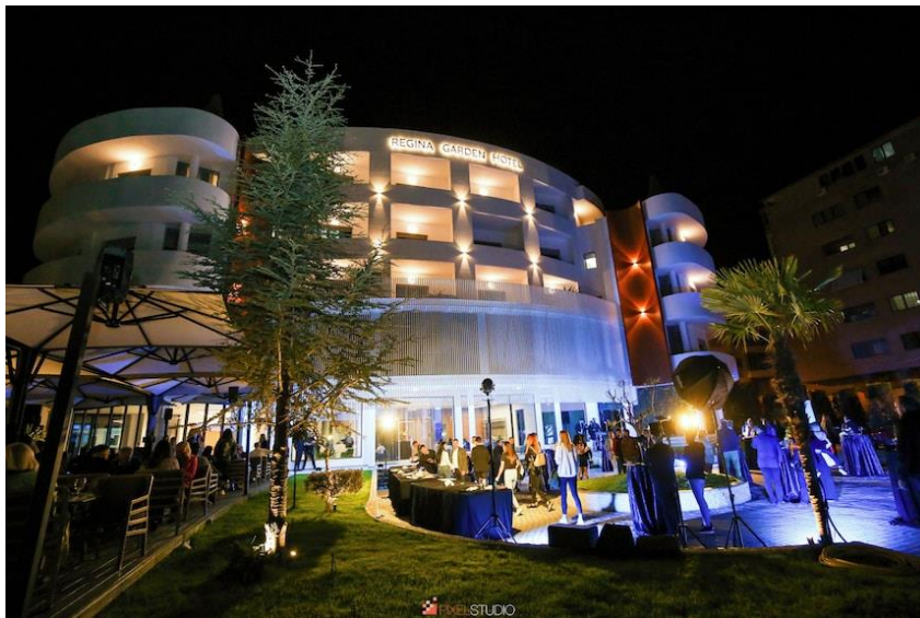
Welcome light dinner