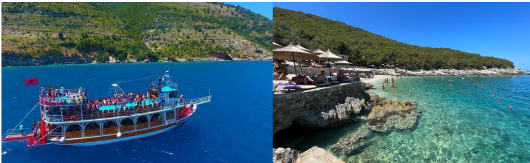
Karaburun trip by boat