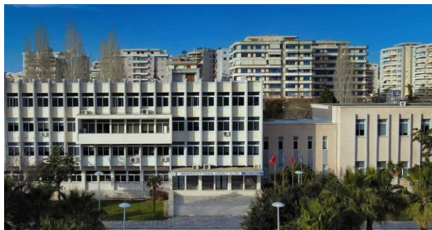
Rectorate Building Conference Hall

University location – conference hall - click here! Where