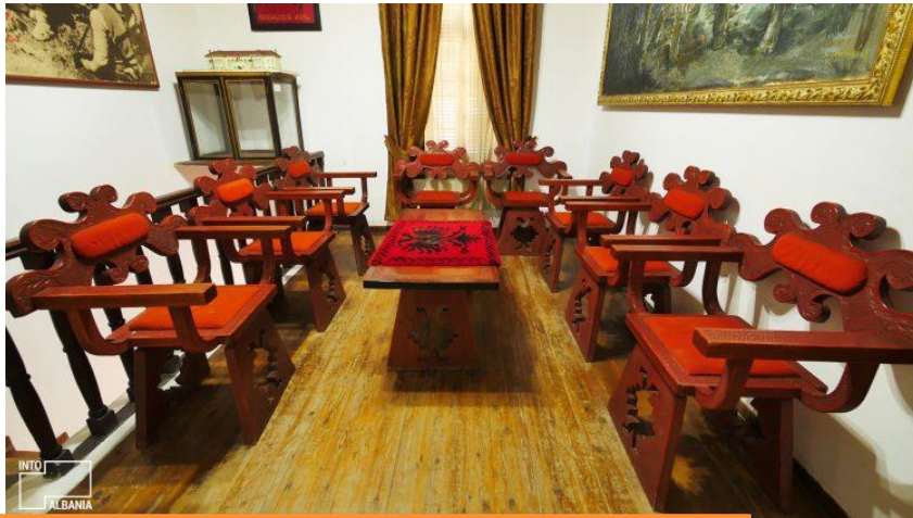
Visit to Independence Museum