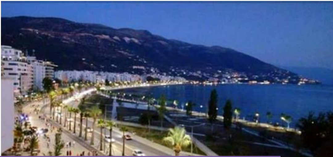
Lungomare by walking